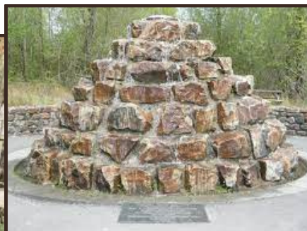
Memorial to the miners who lost their lives in the 1892 disaster