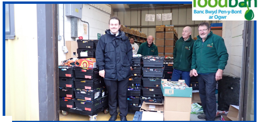
Year 12 pupils working with Bridgend Food Bank December 2023