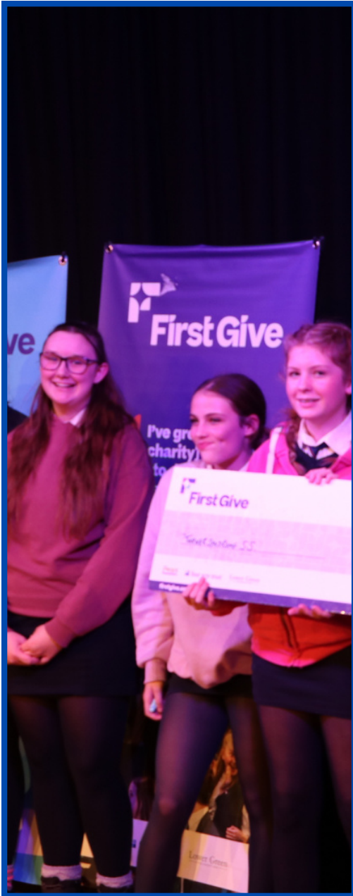
Year 9 winners of the First Give Project December 2023