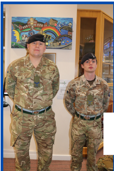
The Army Visiting Year 9 February 2024