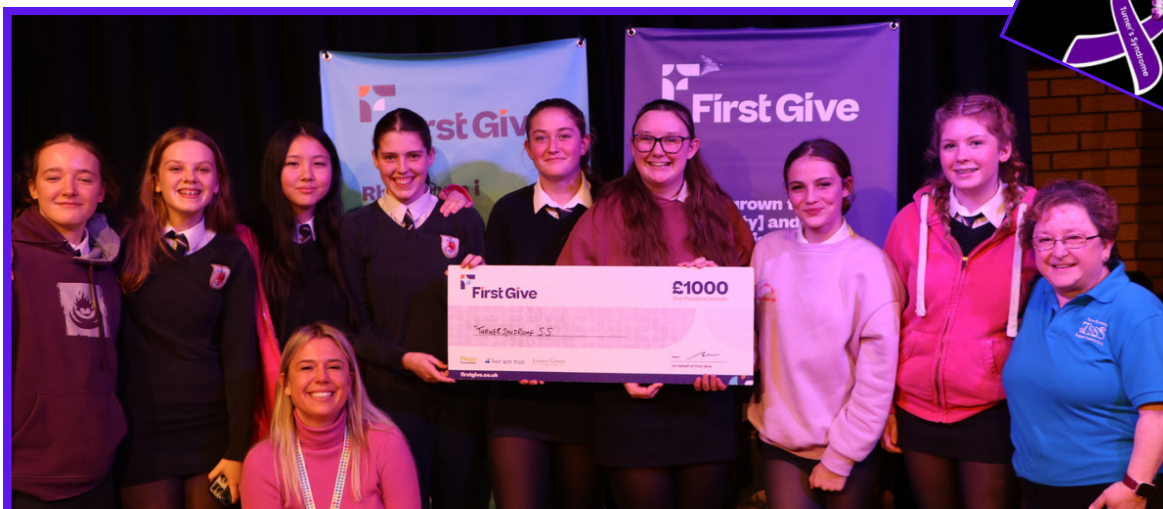
Pupils from 9HR present a £1000 cheque to the Turner Syndrome Foundation at the First Give Final

Each form class had to select and work alongside a local charity to plan and organise social action. Each form class has to select one group to represent the form in the First Give Final. The winning group will receive £1000 from First Give to award to their chosen charity.