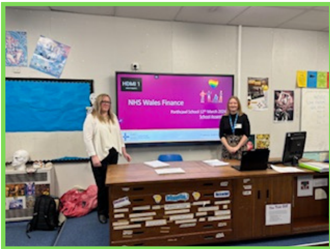
NHS Wales Finance discussing the range of financial careers available in the NHS