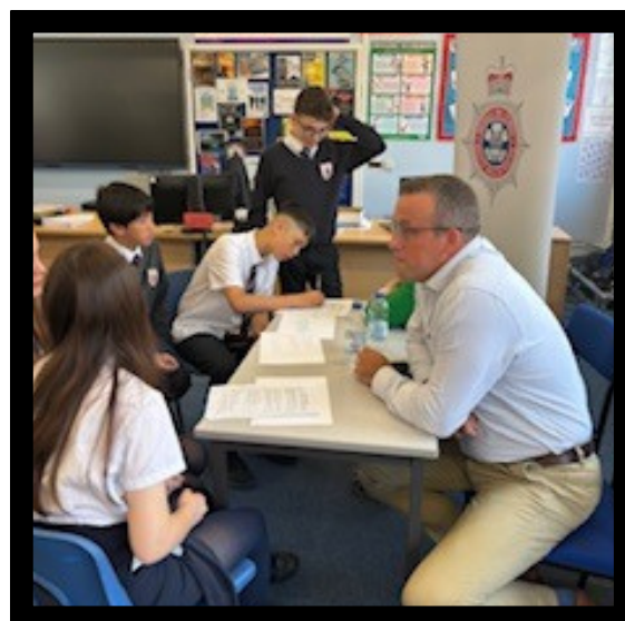
Year 8 pupils discussing potential careers in the Police Force.