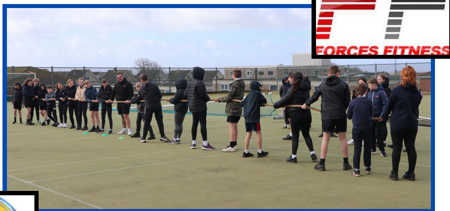
Year 8 pupils working with Forces Fitness developing Team Building Skills - March 2024