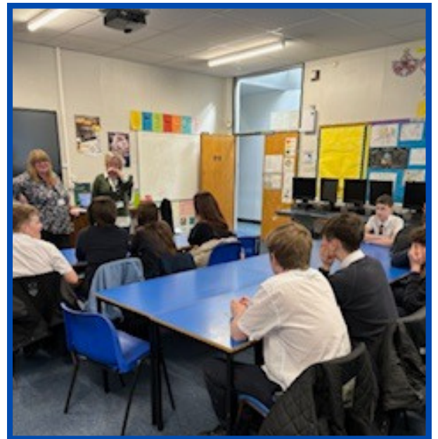
BCBC presented information on career opportunities in Health & Social Care.