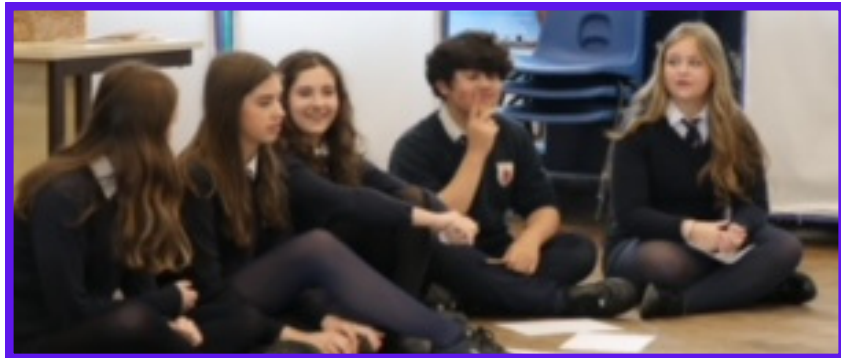
Year 9 Pupils sharing their ideas for a play with the rest of the group